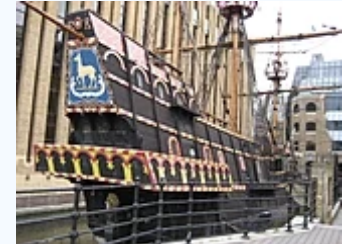
Replica of the Golden Hind