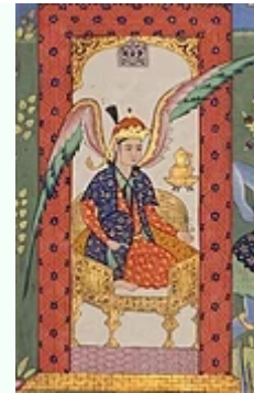
Queen of the fairies in the Khalili Falnama

Archive · Start a new article · Nominate an article