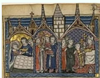
Raymond's appointment as regent by Baldwin IV of Jerusalem

Raymond III (1140–1187) was the count of Tripoli (in modern-day Lebanon) from 1152 until his death. The son of Raymond II and Hodierna of Jerusalem , he was a minor when he succeeded his father. After reaching the age of majority in 1155, he fought the powerful Muslim ruler Nur ad-Din , and hired pirates to pillage Byzantine territories. From 1164, he spent nearly ten years in Muslim captivity. Marrying the wealthy heiress Eschiva of Bures made him prince of Galilee in the Kingdom of Jerusalem . A close