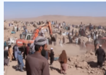
Herat earthquakes aftermath

Ongoing: Russian invasion of Ukraine (timeline) · War in Sudan